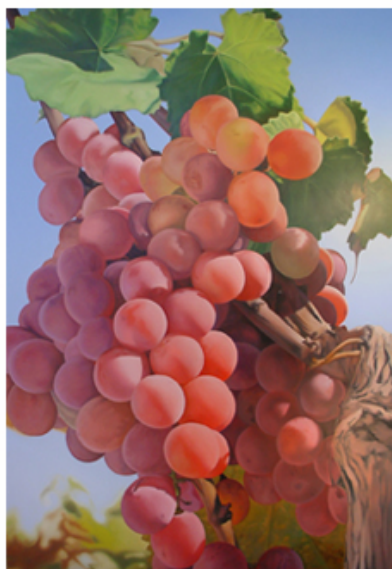
Mustafa Hulusi, "The Elysian Paintings" in the Cyprus pavilion at the Palazzo Malipiero in Venice.